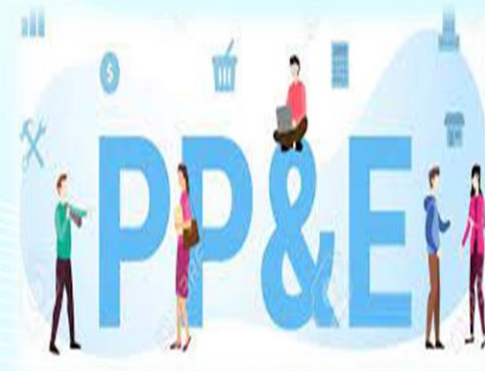
Property, plant and equipment